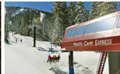
PRIVATE SKI ACCESS