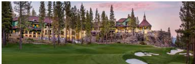
THE CAMP LODGE