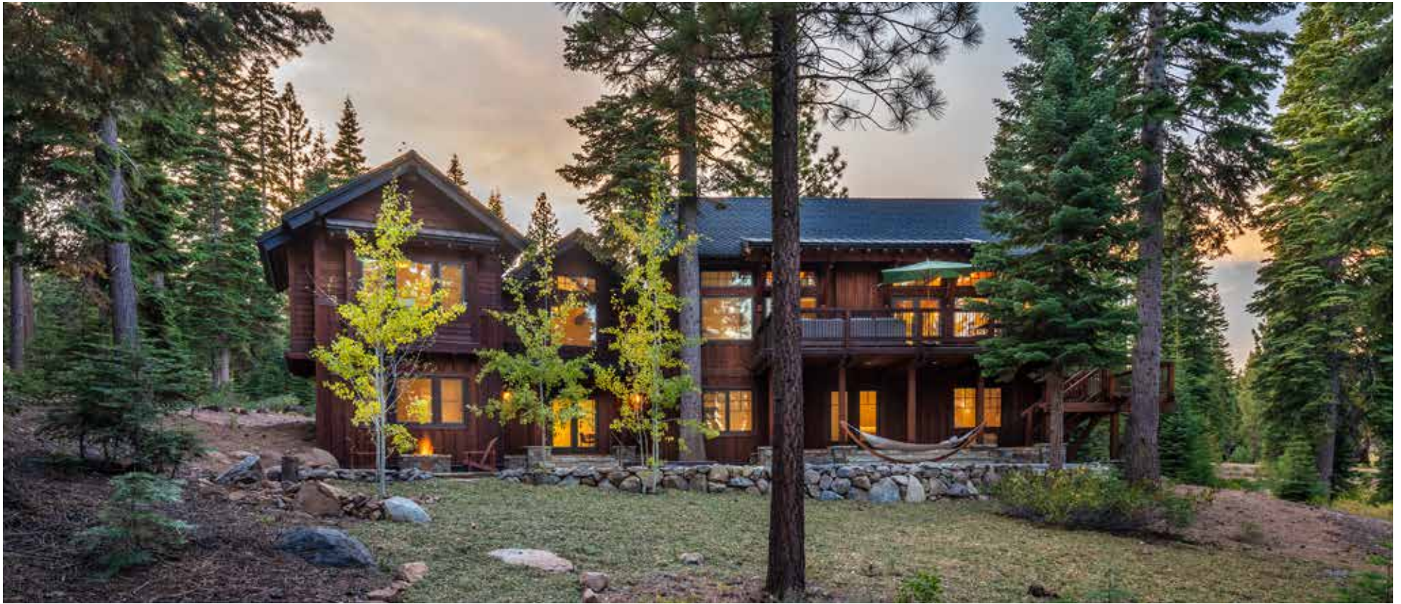
Expansive outdoor patio with firepit and hot tub with hiking trails beyond the back yard